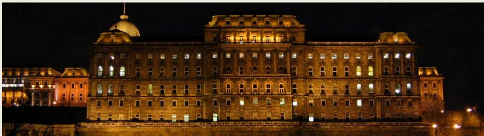
Building and conference room